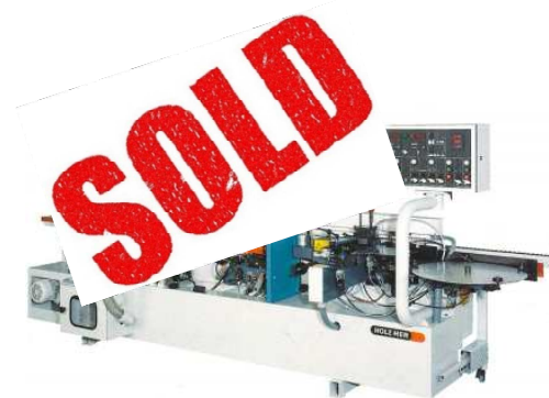
Typ 1436 SE

Automatic Feed Magazine Cartridge Glue Station Pressure Unit. 2 Motor End Trim Top/Bottom Trim HD Profile Scraper Jump Buffer 30 Day Warranty – Parts only Refurbished and ready to go