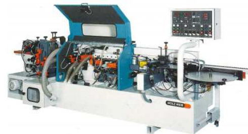
Typ 1436 SE

NOTE: All used machines are fully inspected. All parts which are missing, broken, or show excessive wear are replaced. Each machine is fully tested to ensure proper operation. Each machine is fully cleaned, but not painted.